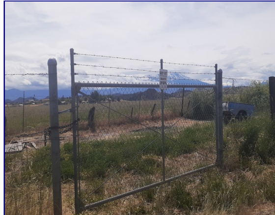
Grenada wastewater treatment pond near the east edge of the town of Grenada. Grenada is under a no-growth policy until a solution can be found for this antiquated system which is at its practical operational limits.